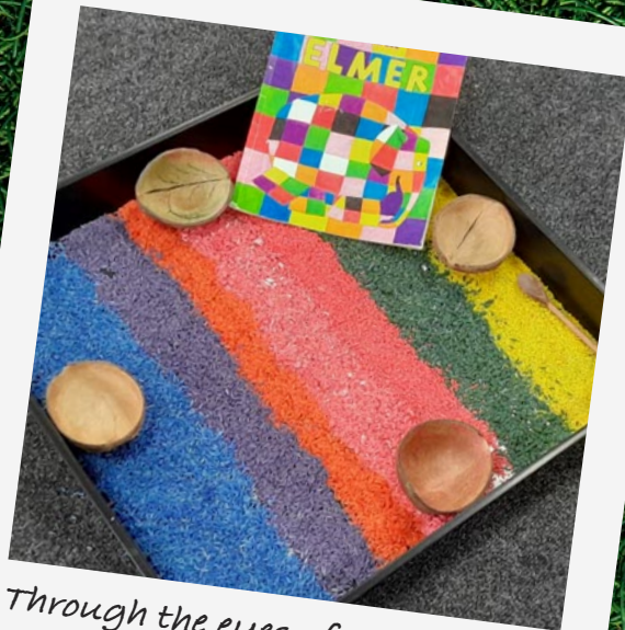
Through the eyes of a 2 year old VIEW DAY