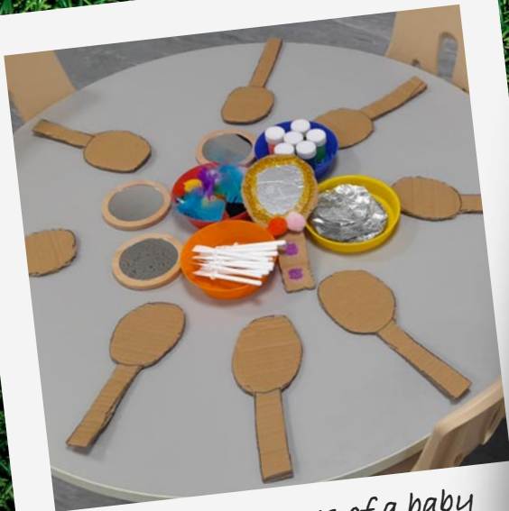
Through the eyes of a baby VIEW DAY