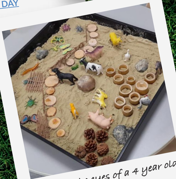
Through the eyes of a 4 year old VIEW DAY